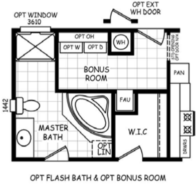
OPT FLASH BATH & OPT BONUS ROOM